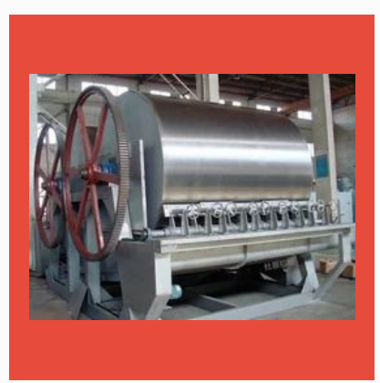
Single Drum Dryer