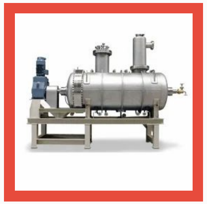
Rotary Vacuum Dryer