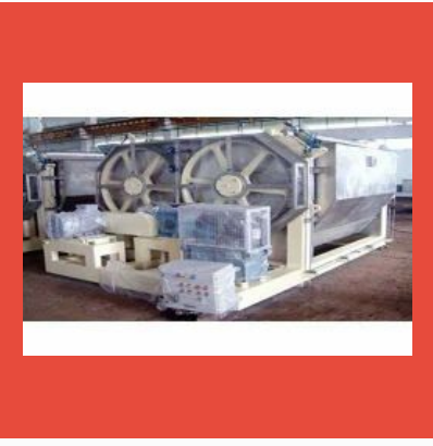
Double Drum Flaker