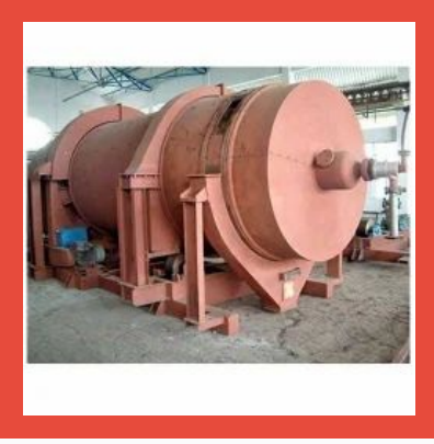
Rotary Cascade Dryers