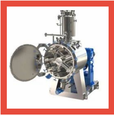
Vacuum Single Drum Dryer