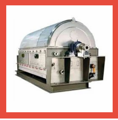
Atmospheric Double Drum Dryer