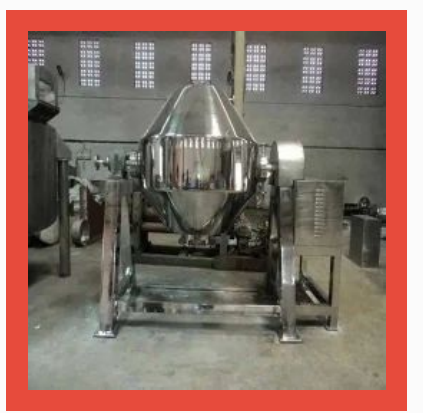
Double Cone Vacuum Dryer