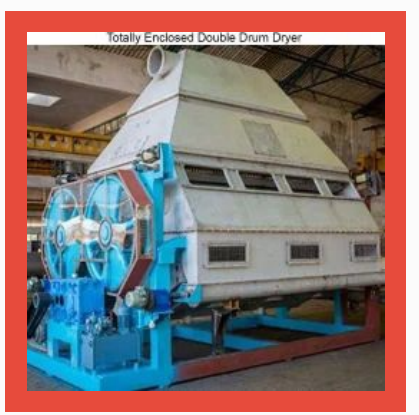
Totally Enclosed Double Drum Dryer