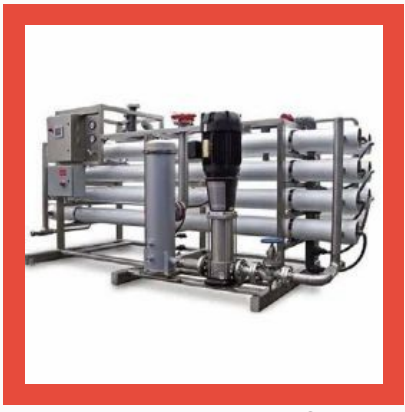
Zero Liquid Discharge System