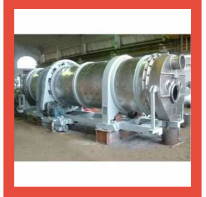
Rotary Louvre Dryer