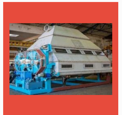
Totally Enclosed Single Drum Dryer