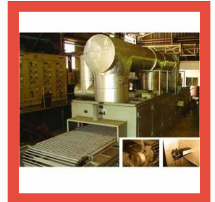
Air Impingement Dryer