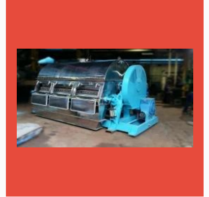
Single Drum Flaker