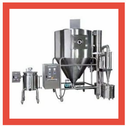
Continuous Particulate Dryer